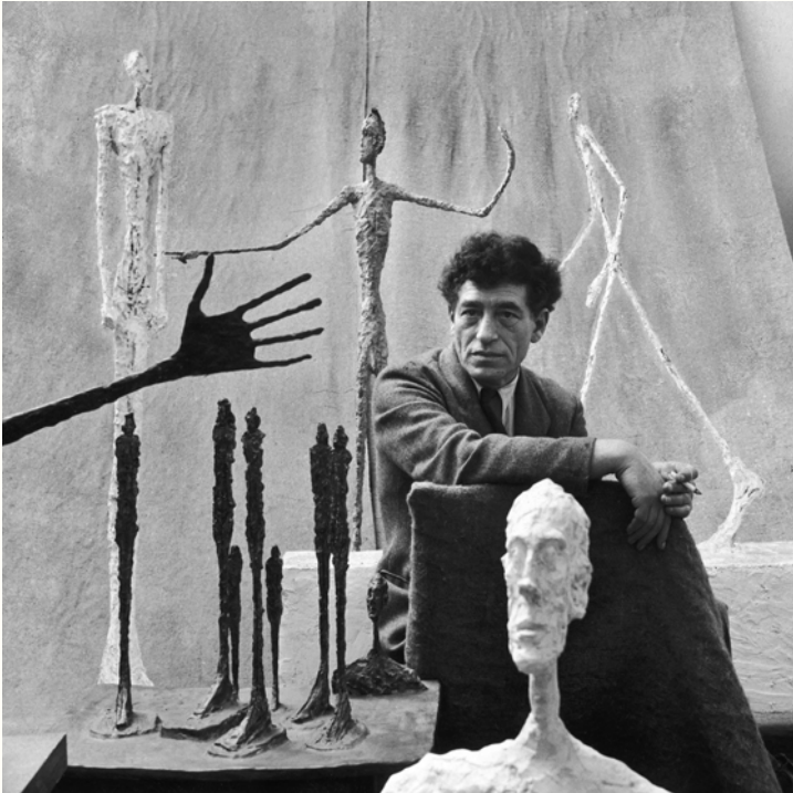
Giacometti, ca. 1950s

In one of his final interviews , Giacometti spoke with noted art critic David Sylvester about his sculptures and the aesthetic of ever-increasing slenderness and height. Sylvester curated the Tate Gallery's inaugural retrospective of the artist in 1965.