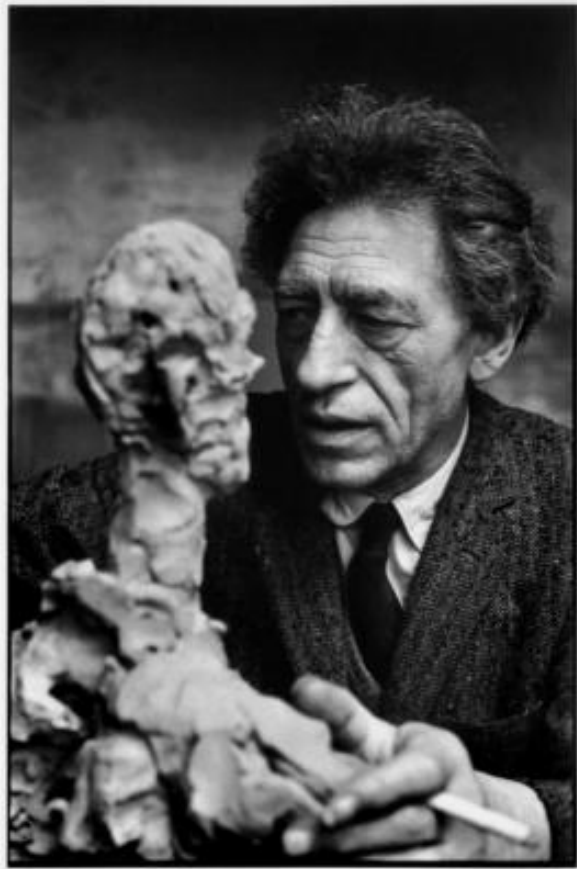
Giacometti, ca. 1960