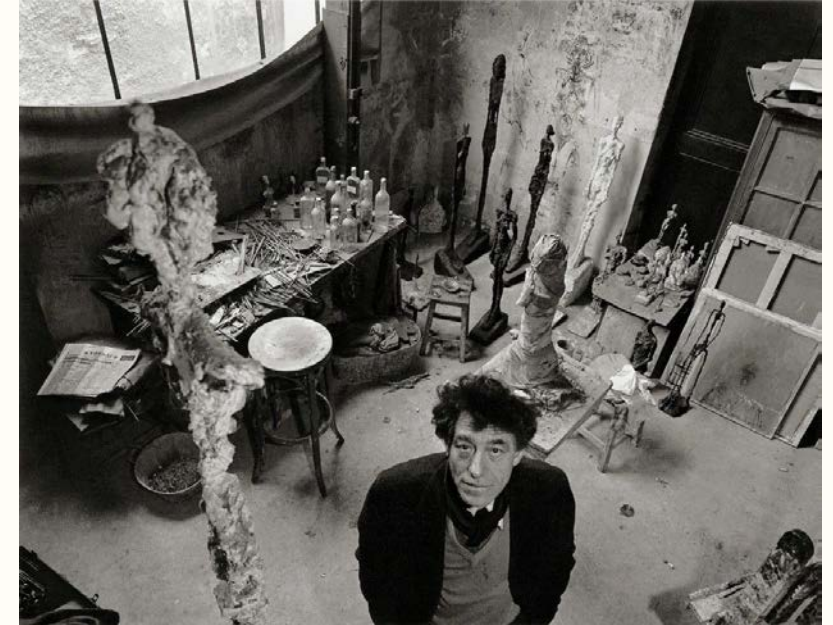
Giacometti in his atelier, 1957

The British Film Institute produced a short film in 1967 in conjunction with the Tate's exhibition, capturing Giacometti at work in his studio sketching from his own sculptures and hand-modeling clay maquettes.